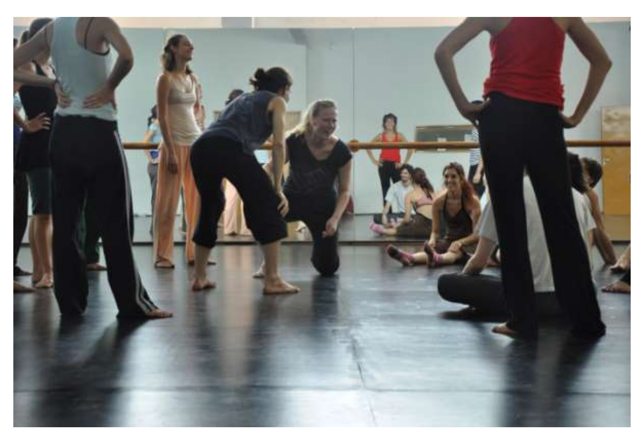
Leading a workshop at the San Martin State Theatre in Buenos Aires.