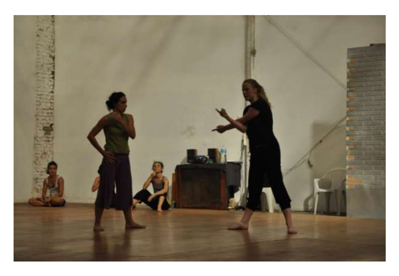
With artists from Casa Dorrego during a creative session.