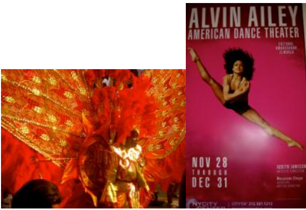
Salsa in New York