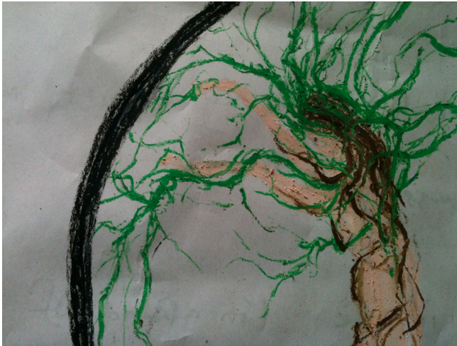
Final self portrait

She intends to use the experience in her workshops in the Ty Hafan Children's Hospice, at the early years and parent classes she runs and within her role as Co-Artistic Director within a newly formed arts organisation.