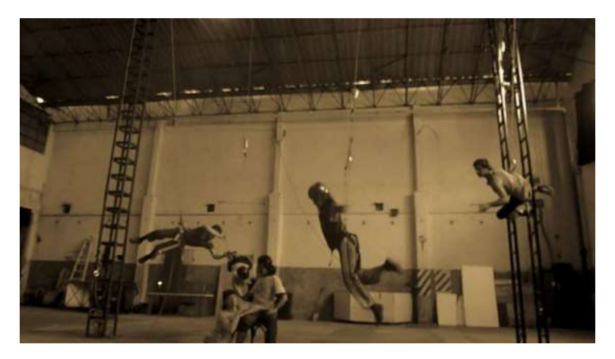
Creative Research with the Cuerda Ensemble

I have made many contacts, establishing links to artists and teachers with potential visits to the UK and Ireland already being planned (Irish Aerial Dance Festival, Edinburgh Aerial and Acrobatic Convention). The relationship with Cuerda is growing and the plans are to involve them in the work that has already been started in Argentina as mentors and creative collaborators.