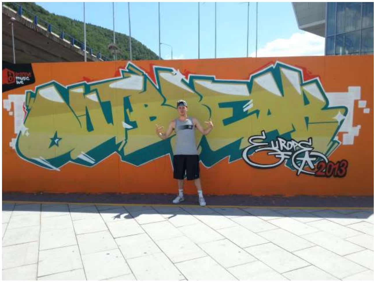
Me in Banska Bystrica, this is the advertising for the Hiphop week outside the main shopping centre.

My delivery style is very fitness based (as is needed for this style of dance), and for my students my style becomes repetitive, so I decided I would like to for my students and self, gain knowledge on different teaching styles and exercises, as well as new movements to bring back to Wales and pass on all the knowledge I have learnt. I found out about the Catch the Flava Camp on the BboySpot Website (the Bboyspot is a well known international breakdancing discussion forum and equipment store) and saw the International Pioneers (some of which I have always looked up to since starting this dance) and thought "I NEED TO GO!".